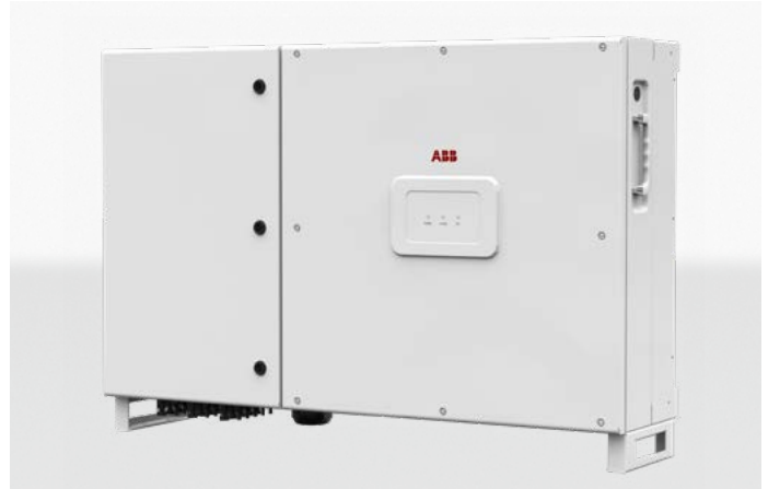
ABB string inverters PVS-50/60-TL